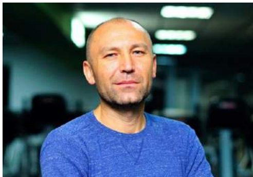
Ukrainian agribusiness is interesting for investors