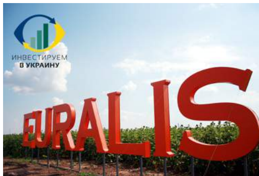
We invest in Ukraine: EURALIS (France)