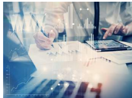
IT company: software integrator for business